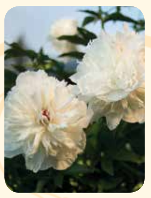
Common Peony - Paeonia lactiflora

The Common Peony provides fragrant pink, burgundy or white flowers in June. It's a long-lived flower and you'll find original plants still looking great in some of Calgary's oldest communities.